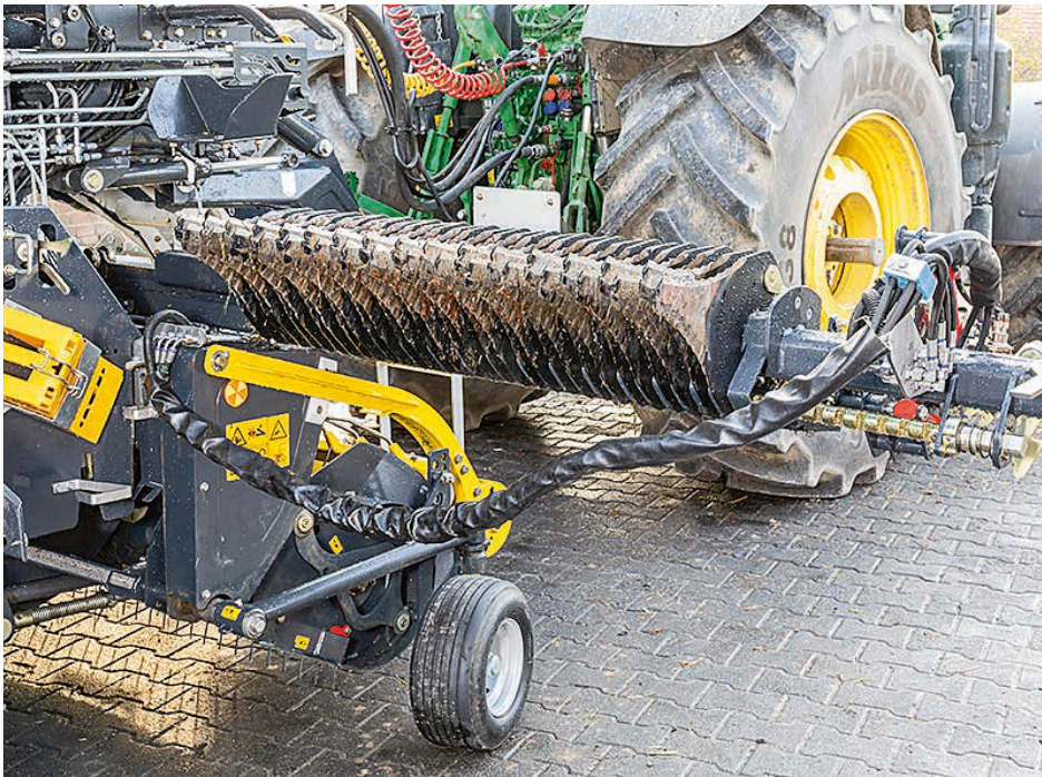
The knife drawer is released manually and can then be pulled out to the right.