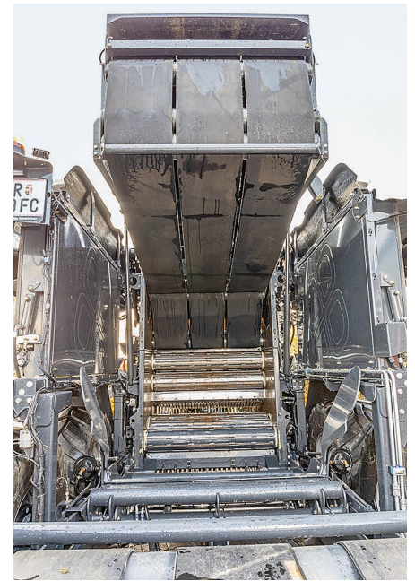
The baler relies on four rollers and three belts that can create a very small chamber, so the material is compressed right from the start.