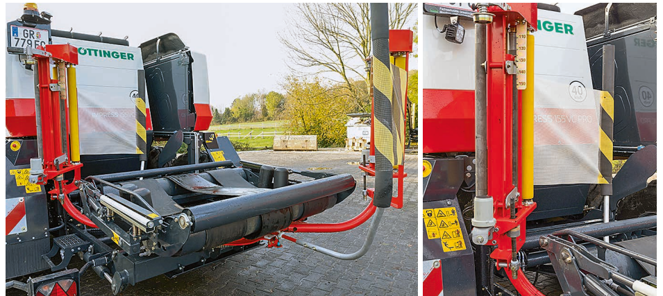
The wrapper gave trouble-free operation during our practical test. To work with different diameter bales, the Impress's dispensers move vertically in a parallelogram.

On the variable-chamber machine there are four bale-forming rollers: one serving as the traditional starter roller and three endless belts. When the bale is starting there's so little room in the chamber that the bale starts to roll almost instantly (Pöttinger calls this a pre-chamber).