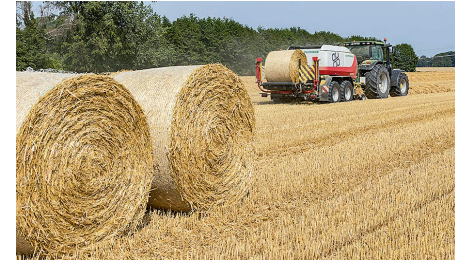
The variable-chamber baler comes into its own in straw. The combi unit allows bales to be dropped in pairs – useful when gathering up.

The wrapper unit can work with bales from 1.10m to 1.50m in diameter. The vertical position of the dispenser arm is changed on a parallelogram frame, so it applies the film to the belly of the bale. Adjusting the position is a quick job that requires a 19mm socket. When wrapping bales 1.45m in diameter or more, we did have the occasional film break,