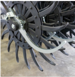
Stone guard for each star