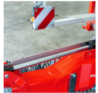
Folding cylinder guard