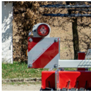
Warning sign with lighting